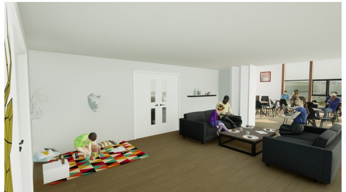
Architect visualisations of the inside of the new Pavilion